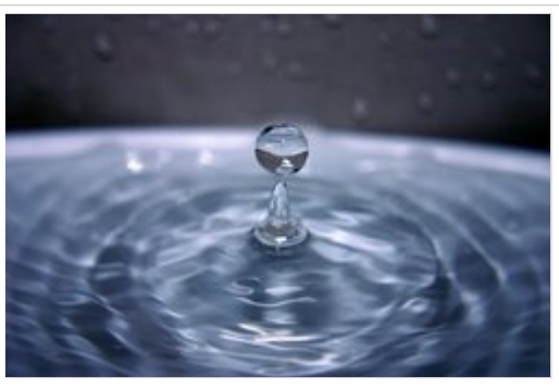
Figure 4: The adhesive bonding property of water molecules allows for the formation of water droplets.

despite gravity's downward pull. Water's high surface tension allows for the formation of water droplets and waves, allows plants to move water (and dissolved nutrients) from their roots to their leaves, and the movement of blood through tiny vessels in the bodies of some animals.